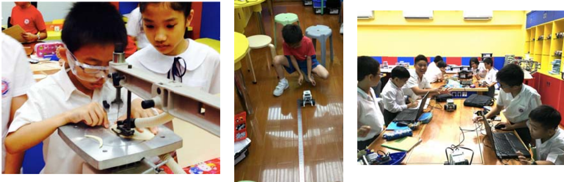
Figure1: Primary students in our DT course

To encourage the innovative spirits and engineering designs through hand-on works, innovative and logical thinking skills, we introduced the Design & Technology Course in 2012. Now our DT course is a series lessons from Primary 5 to Senior 2. Students can broaden their global perspective, strengthen their collaboration and competitive vitality through the course.