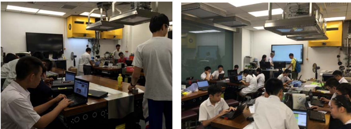
Figure2: High School students in our DT course