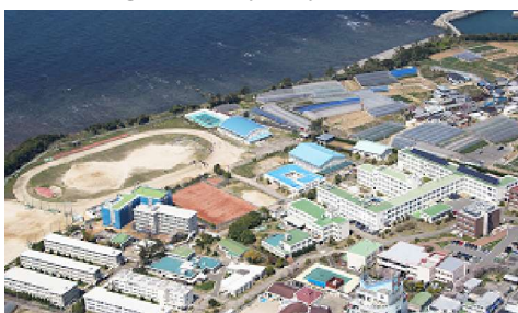
Fig.1 National Institute of Technology, Wakayama College

As described in this document, our college is aiming to become the internationally open college with a good local communities. We are learning the leading edge of science and technologies every day to become active engineers in the future.