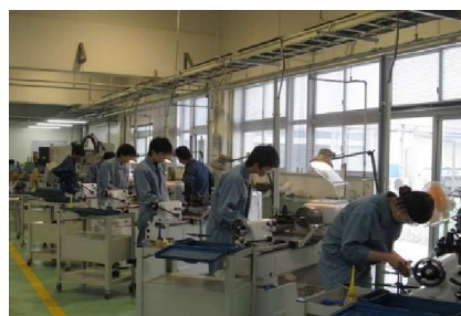
Fig.2 Facilities and equipment