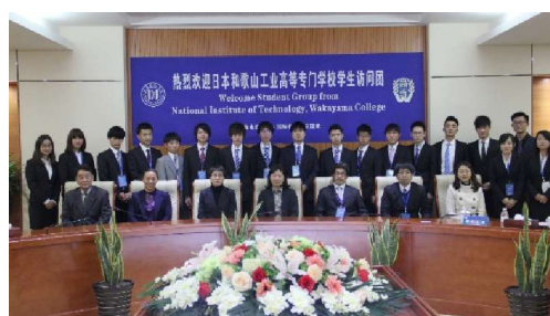
Fig.4 Students exchange program